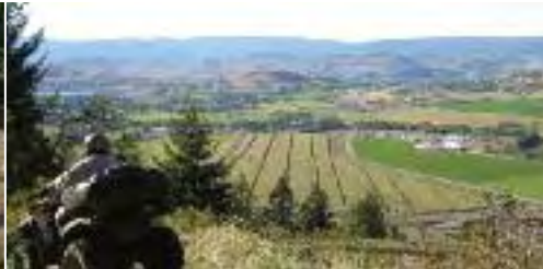
VERNON POKER RIDE 2009: (Top row) Overlooking high above Kalamalka Lake; hitting the trail through the grass lands; (bottom row) King Eddy Plateau; overlooking the Coldstream Valley.