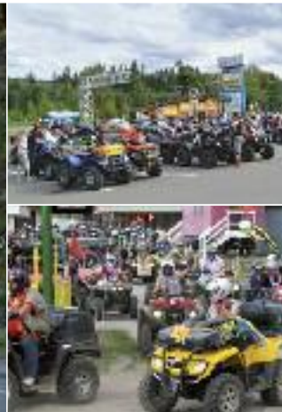
AND THEY'RE OFF: The 2009 Poker Ride brought together ATVers from all over the province. ATV/BC members enjoyed rides over much of the impressive terrain that Princeton has to offer.