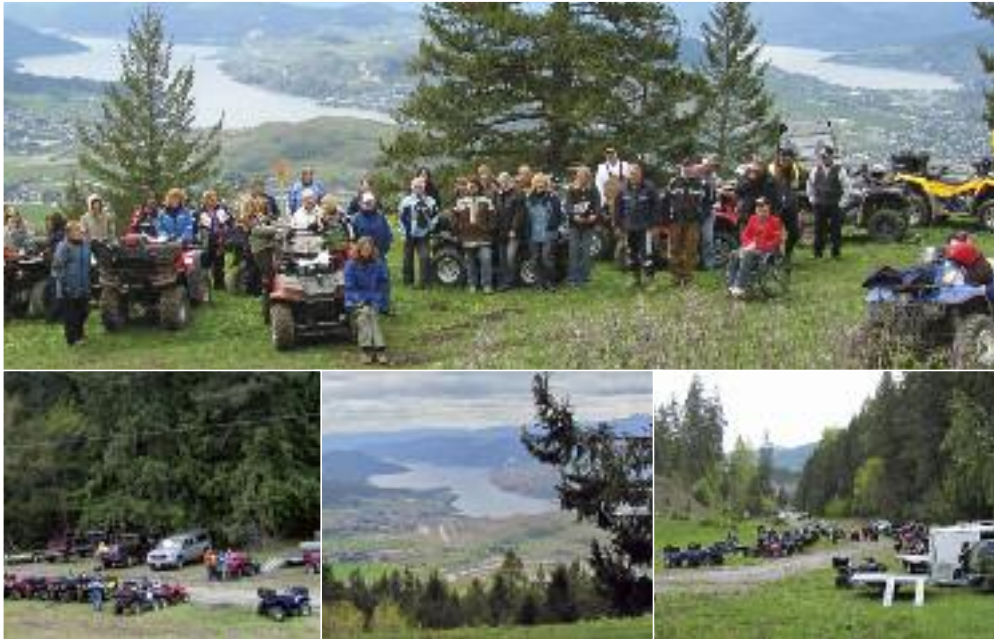
BEING PAMPERED: Ladies of the Vernon ATV Club left their cleaning cloths behind and took to the dusty trails on the Ladies Only Ride; (top) guys and gals enjoyed a healthy lunch with a view.